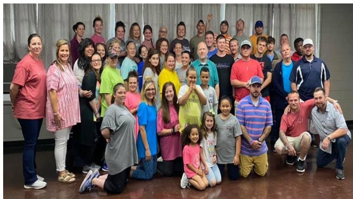
God's House of Hope-Kilmichael, MS