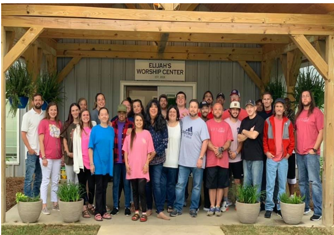
God's House of Hope-Nettleton, MS