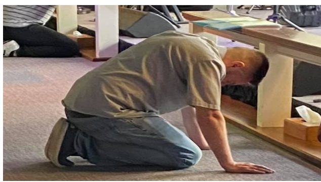
Adult & Teen Challenge Northern Indiana