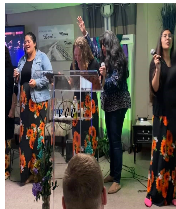
VCC- Vincennes, IN