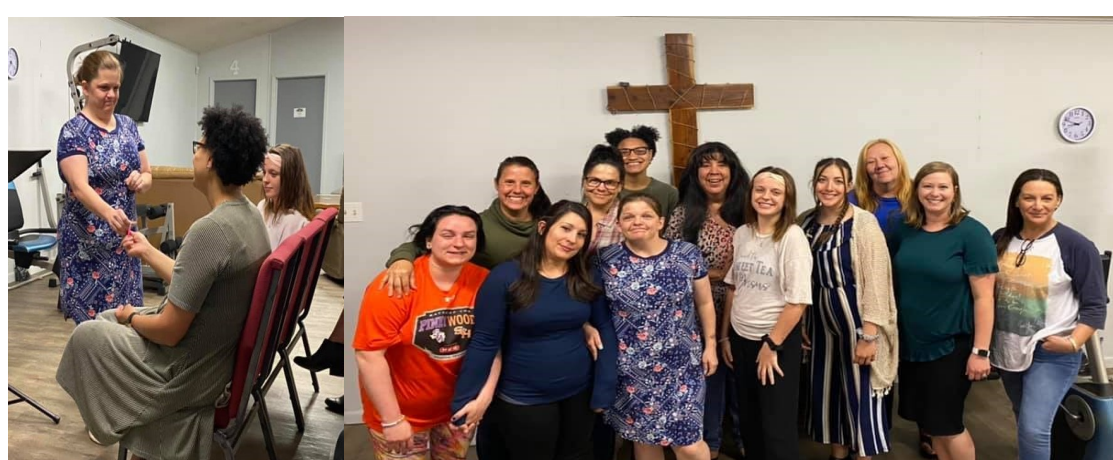
ATCOT– East Texas Women's Center