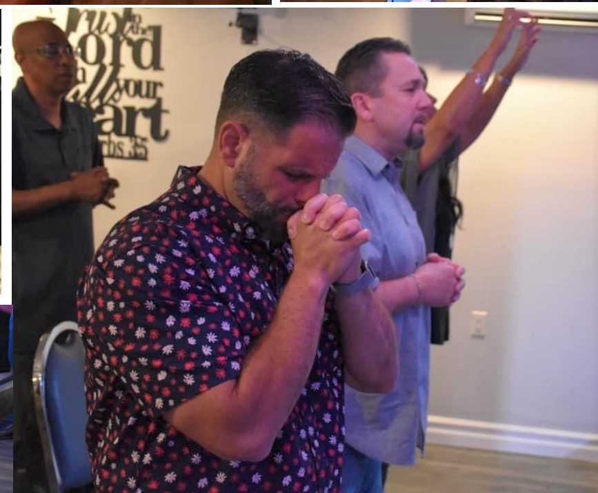
Brooklyn Teen Challenge