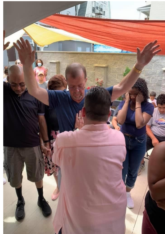
Rockaway Park, NY