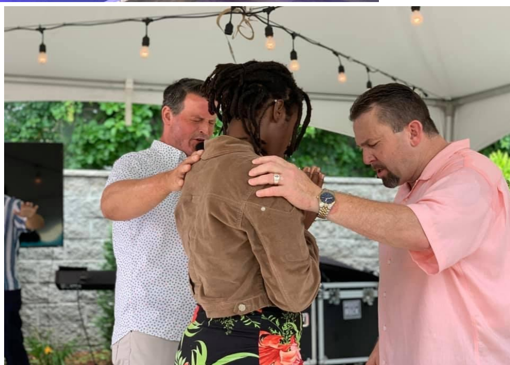
House on the Rock Church