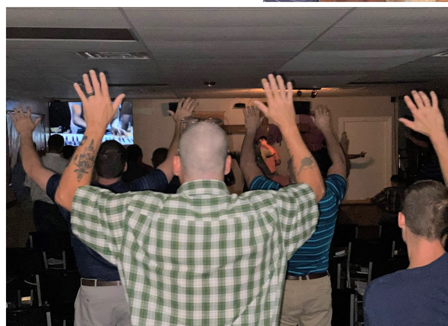
Mercy House ATC Georgetown, MS