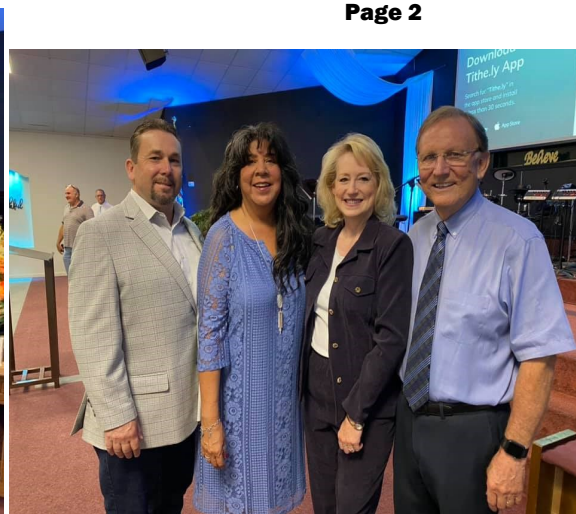
Springs of Praise Church Crystal Springs, MS