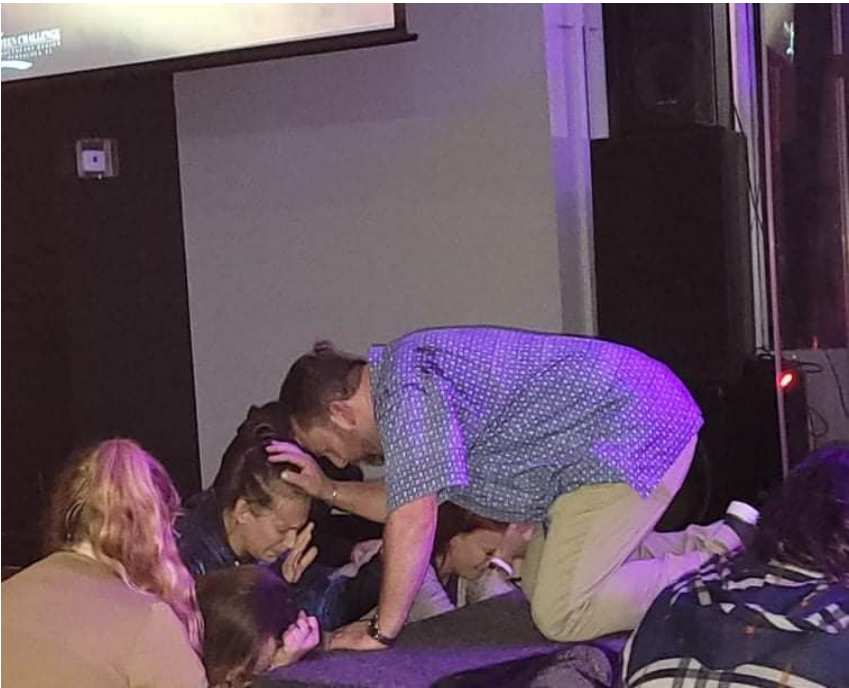
Pensacola Teen Challenge