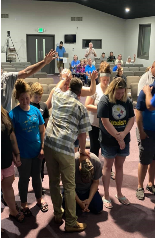
New Journey Church-Knoxville, IA