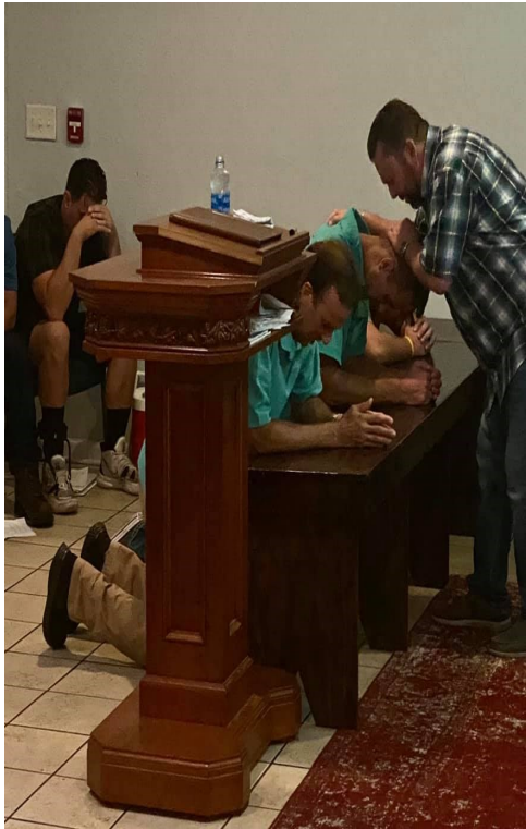
Tallahassee Teen Challenge