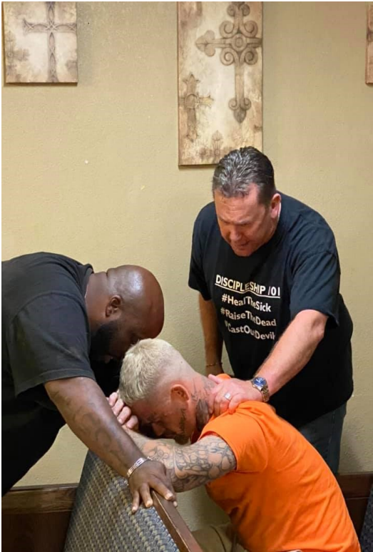
Restoration of Hope-Texarkana