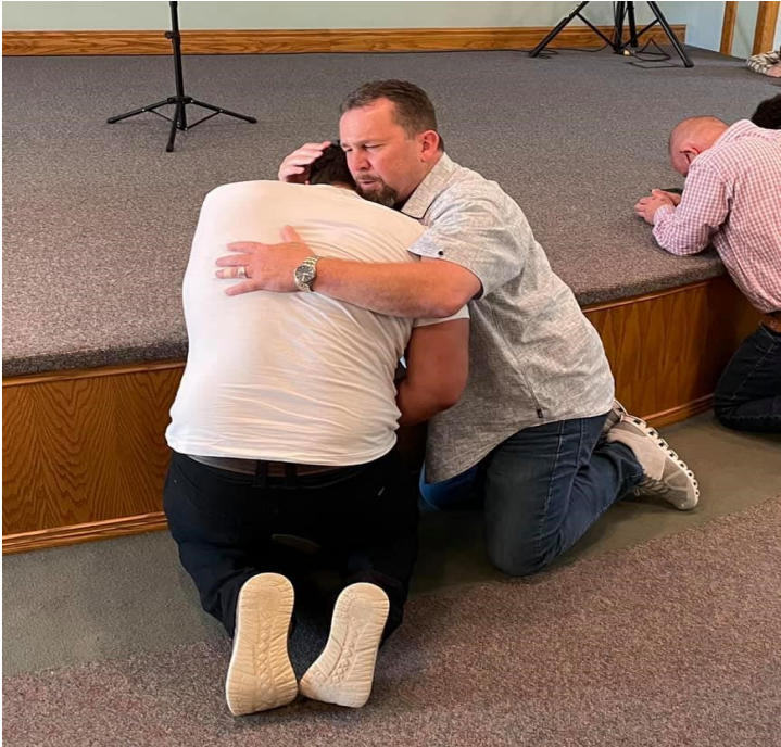
Colfax Teen Challenge