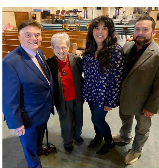
Victory Christian Center-Azle, TX