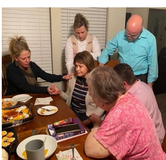
Abby's House-Fort Worth, TX