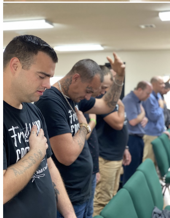
Adult & Teen Challenge of Four States-Neosho, MO