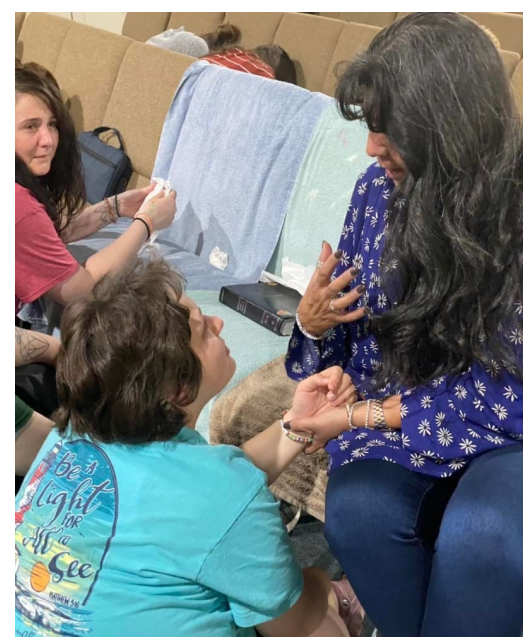
San Antonio Women's ATCOT-San Antonio, TX