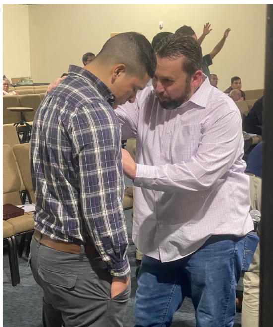
San Antonio Men's ATCOT-San Antonio, TX