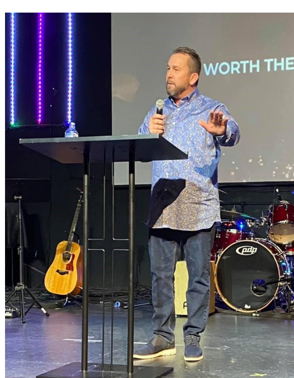
Freedom City Church-Springfield, MO