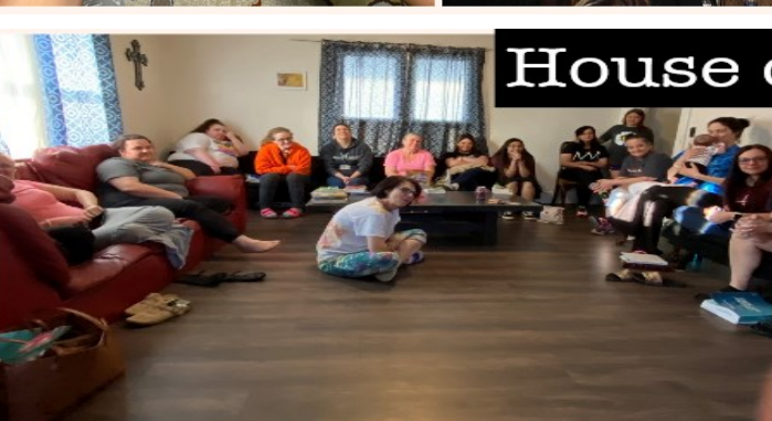
House of Victory