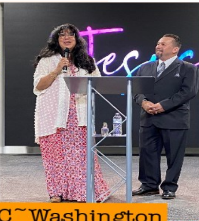
VCC ~ Washington