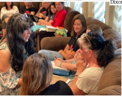
Dixon Kentucky Women's Teen Challenge