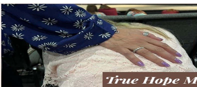
True Hope Ministries