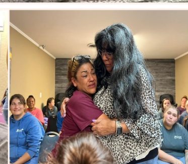
Green Country Women's Teen Challenge