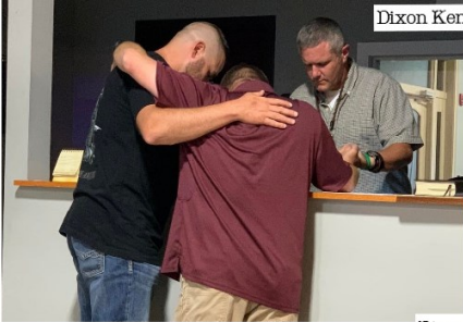
Dixon Kentucky Men's Teen Challenge