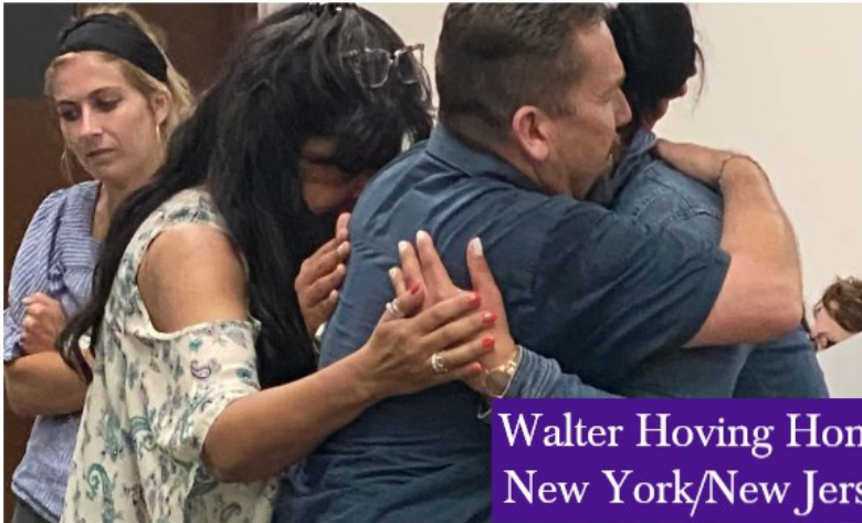
Walter Hoving Homes New York/New Jersey