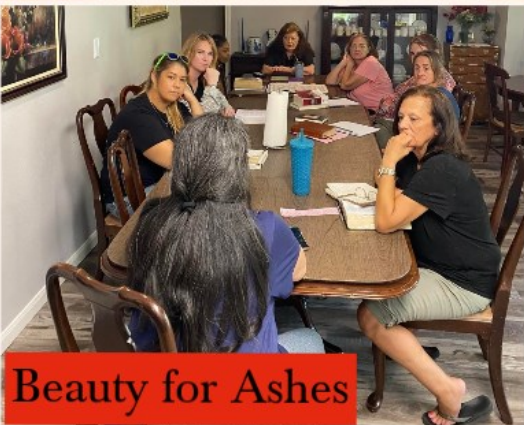
Beauty for Ashes