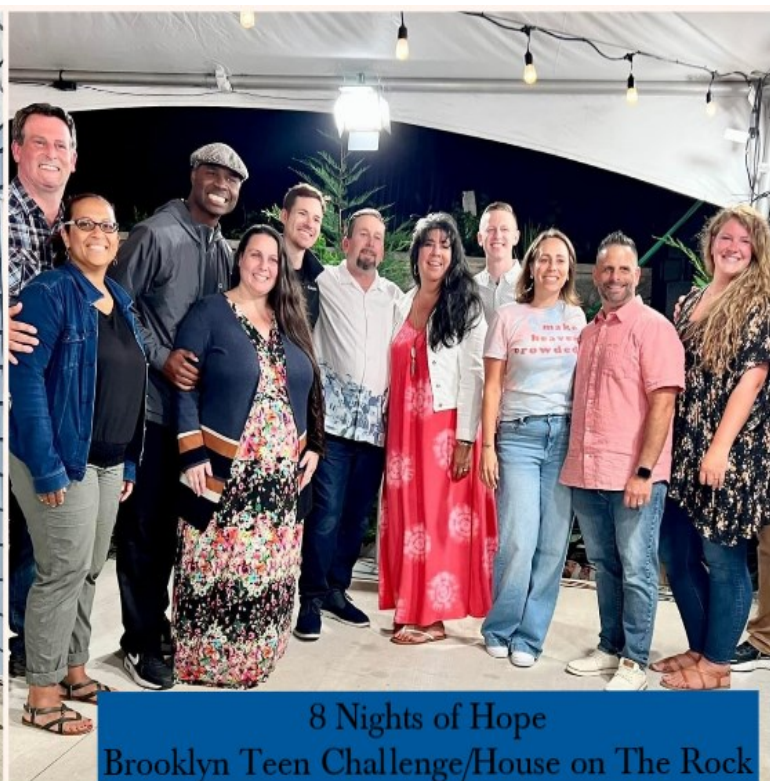
8 Nights of Hope Brooklyn Teen Challenge/House on The Rock