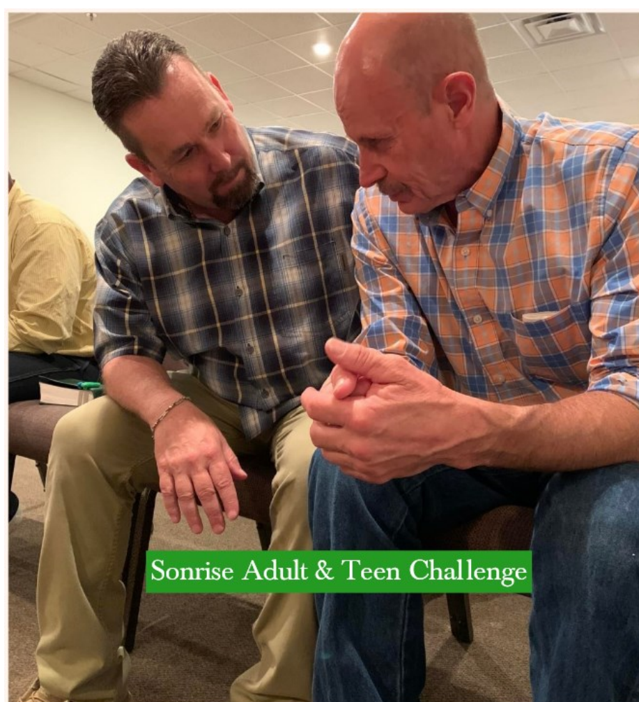
Sonrise Adult & Teen Challenge