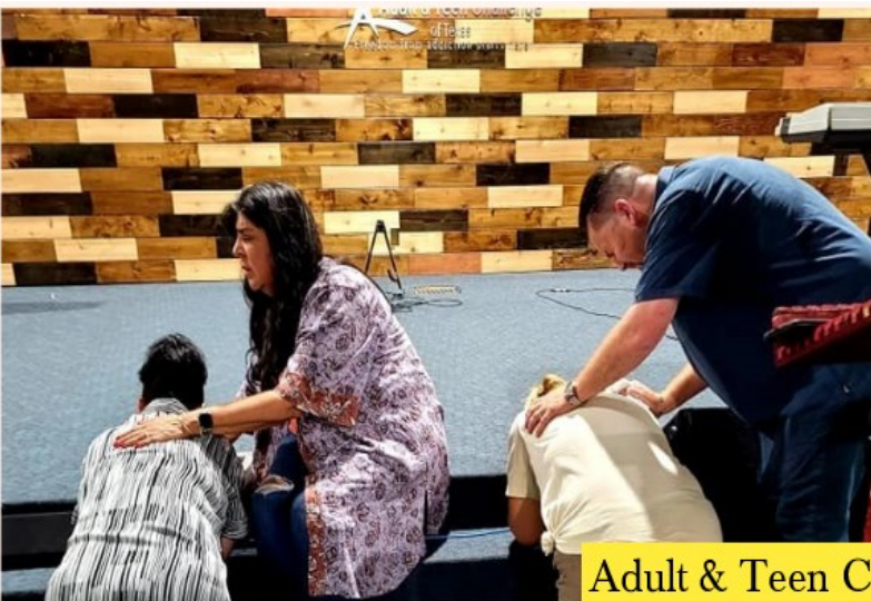
Adult & Teen Challenge of Texas San Antonio Men & Women