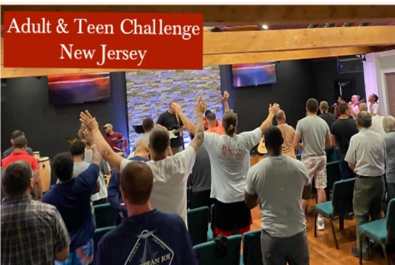
Adult & Teen Challenge New Jersey