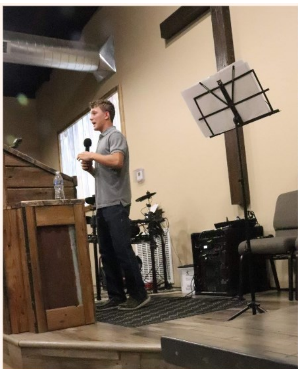
Central Oklahoma Teen Challenge